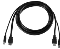
CK-6H HDMI KVM cable, 6 ft 4K 60Hz