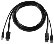
CK-6P DP KVM cable, 6 ft 4K 60Hz