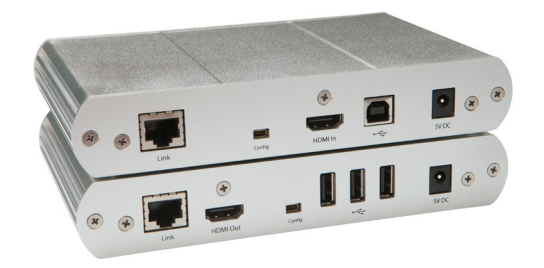
Rear view of LEX (top) and REX (bottom)