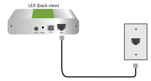
Max 100m between network devices

1 Place the LEX where desired and connect a CAT 5e/6/7 patch cable from the Link port (RJ45) to a network switch or wall network port connected to a switch.