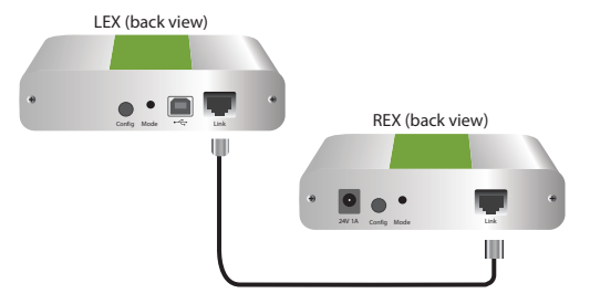
Max 100m (CAT 5e/6/7 cable not included)

1 Place extenders where desired and connect the CAT 5e/6/7 extension link cabling to the Link ports (RJ45) on the LEX and REX.