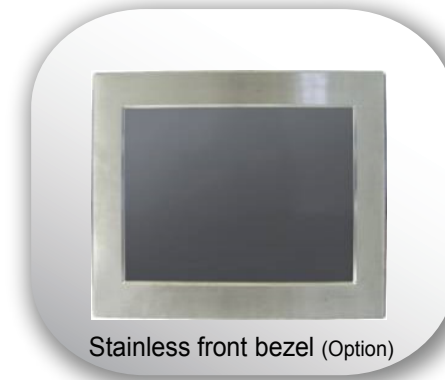
Stainless front bezel (Option)