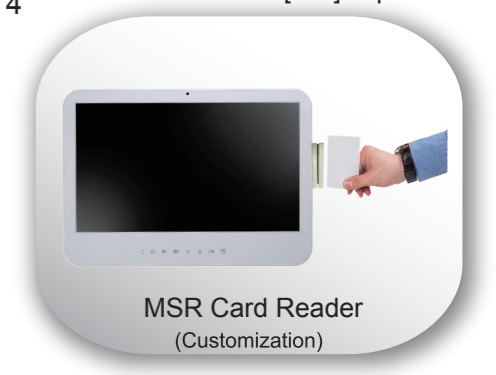
MSR Card Reader (Customization)